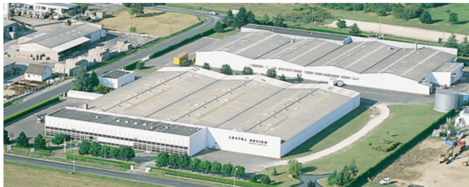
Amboise factory & warehouse