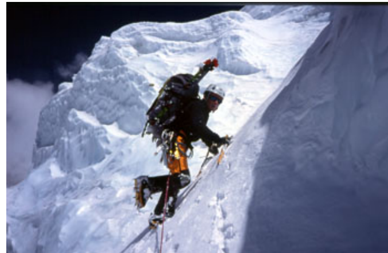
Jean Christophe Lafaile - Between Camp 1 & 2 - 6,100m